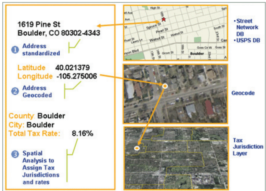
How Enterprise Tax Management works